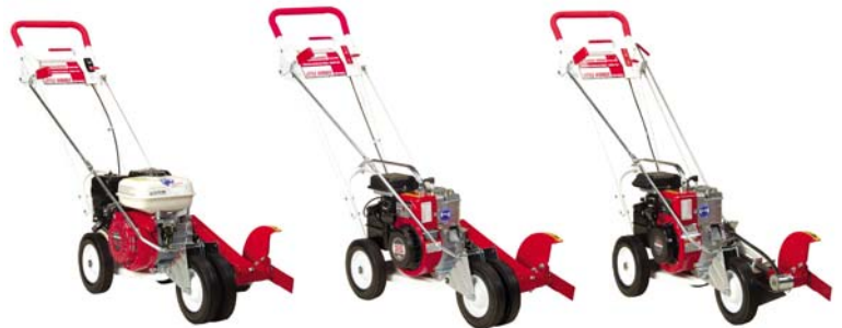
Little Wonder offers a selection of hard working engine models. From left: Pro Honda, Pro Briggs and Deluxe Briggs.

All Little Wonder products are constructed for heavy-duty daily usage and are designed with the professional user in mind.