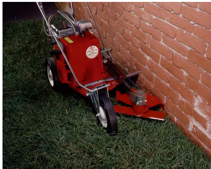
Above Left: Pro Honda w/Crack Cleaner attachment. Right: Deluxe Pro Edger in horizontal trimming position